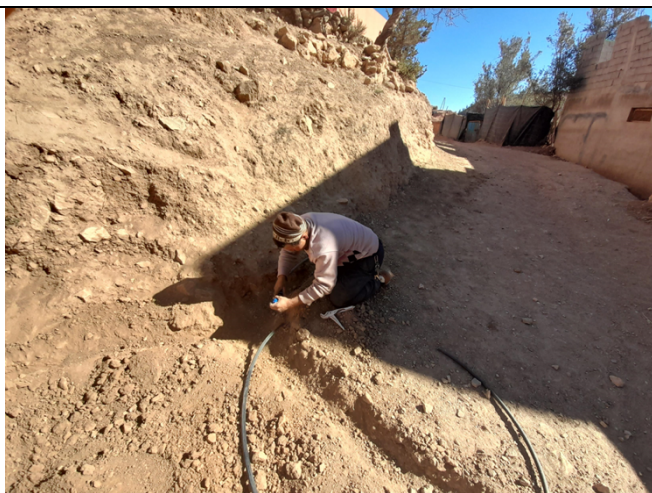
Taroudant – Tirzat – Plumber making connection in the new water lines connecting to the new water points.