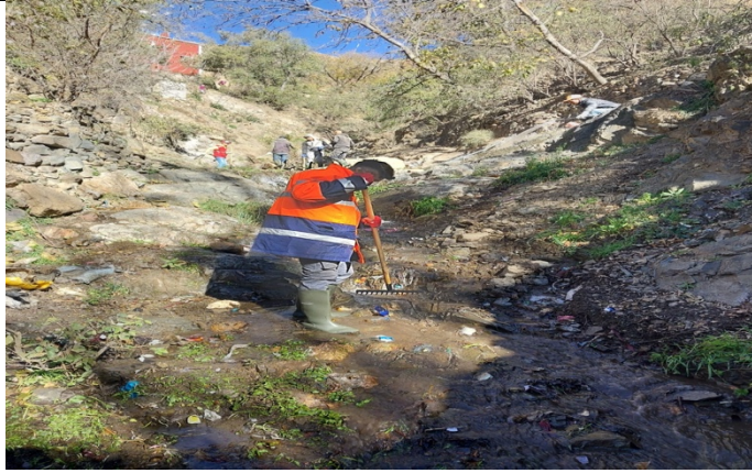
Al Haouz – Idisyar/Ait Zitoun Hygiene promotion and training: clean up of the main river