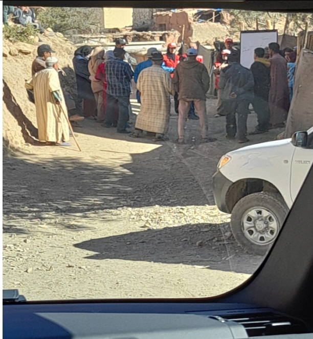
Taroudant –Ayt Youssef 22-12-23 Community participatory mapping on where to locate new latrines