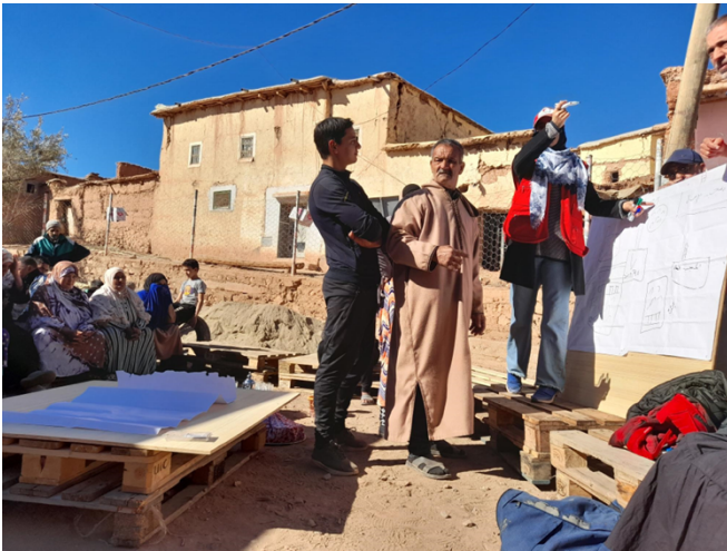
Chichaoua Hygiene Promotion