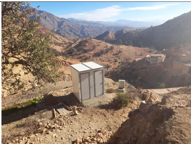
Taroudant – Tirzat – New Latrine and shower for men near the new tent mosque