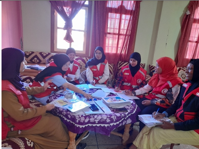
Taroudant 28/12/23 Hygiene Promotion Volunteers at Ouled Berhil in a capacity building and field visits scheduling meeting