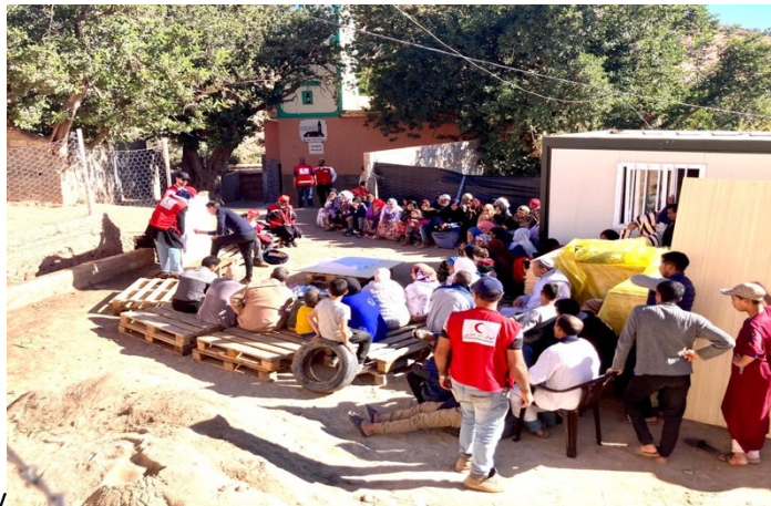
Taroudant –Tirzat 26-12-23 Community