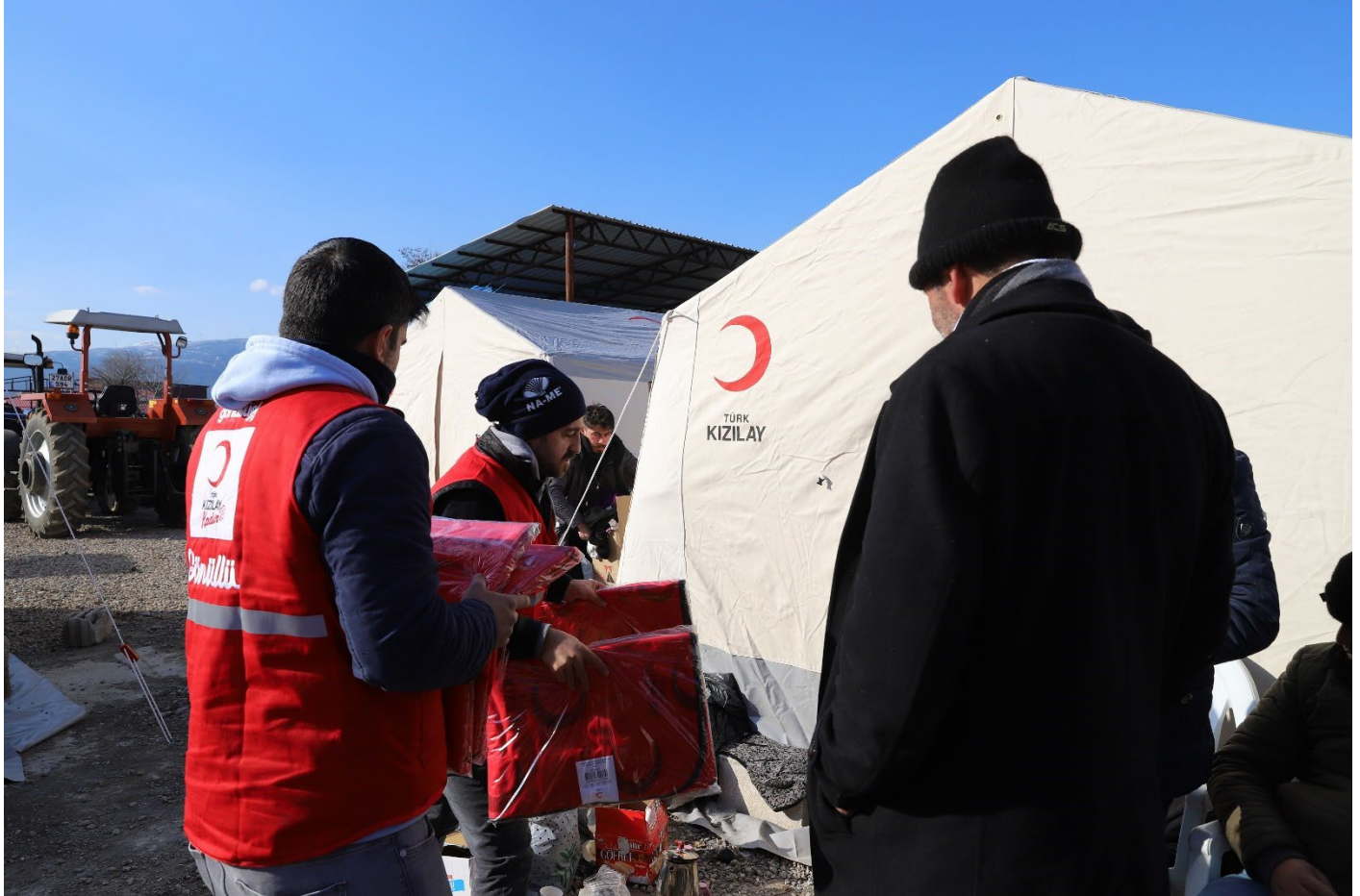
Turkish Red Crescent teams supporting the relief efforts on the ground.