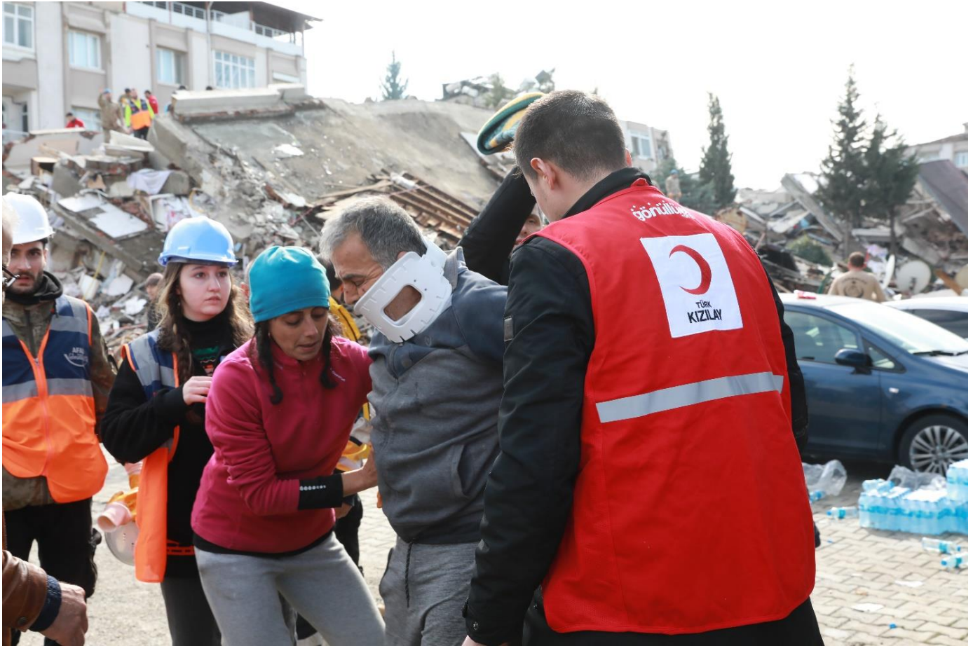
Turkish Red Crescent teams supporting the relief efforts on the ground.