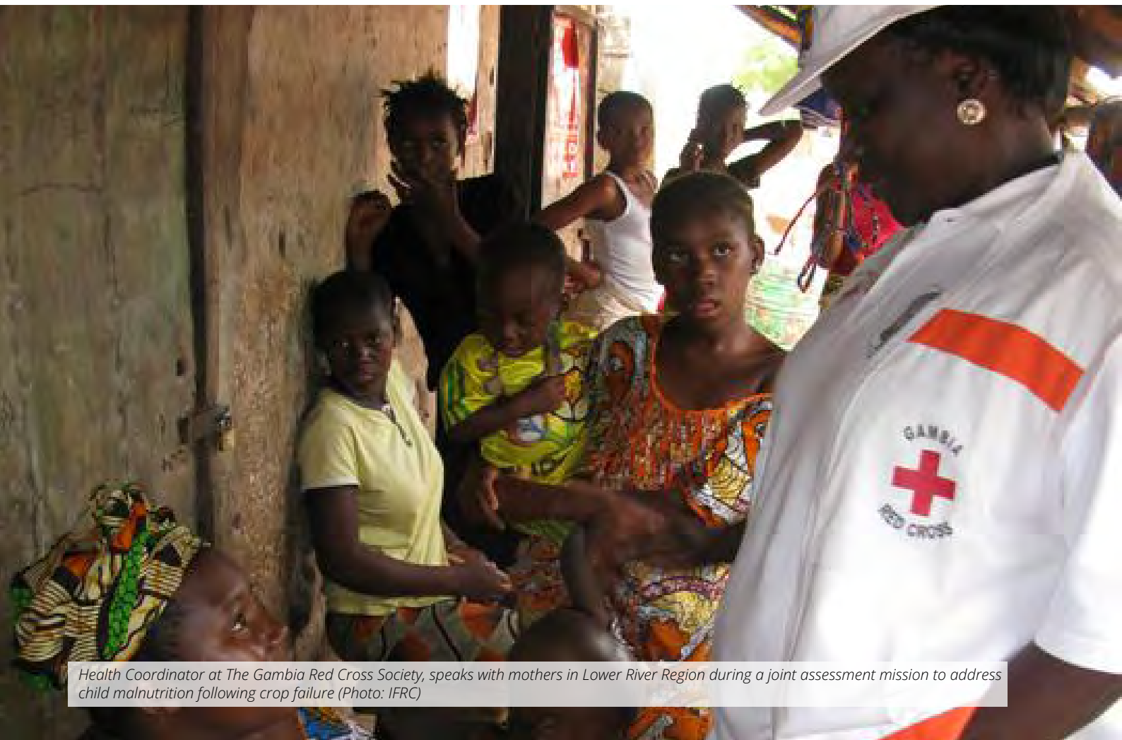
Health Coordinator at The Gambia Red Cross Society, speaks with mothers in Lower River Region during a joint assessment mission to address child malnutrition following crop failure