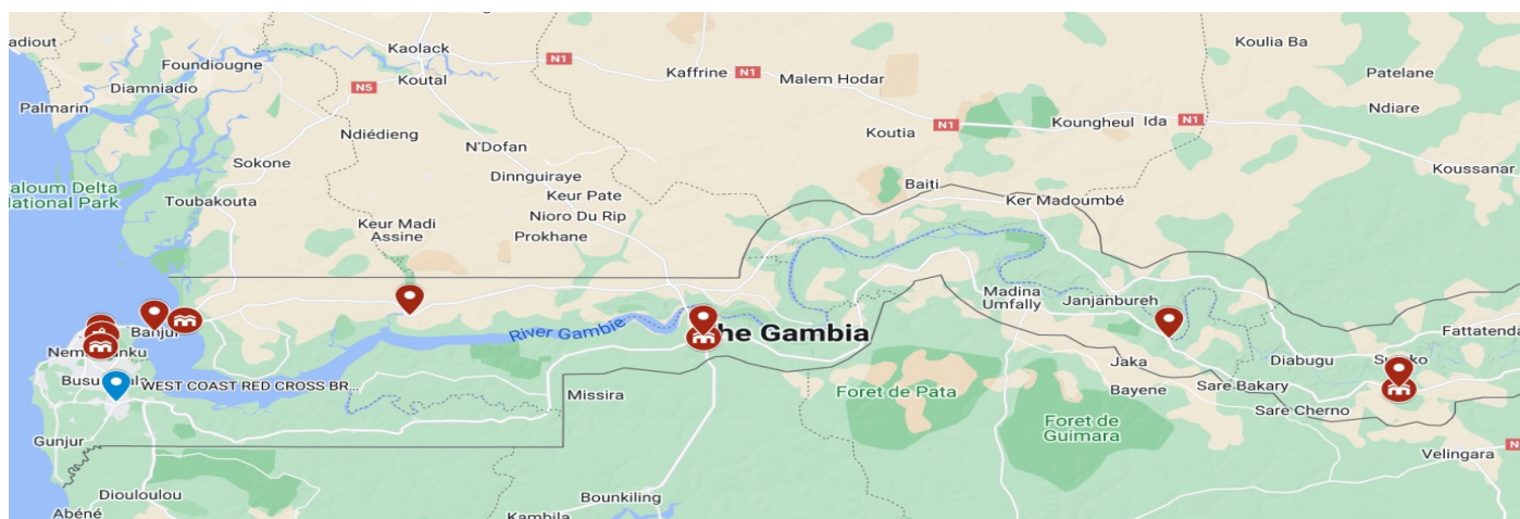
Map of The Gambia Red Cross Society branches and humanitarian service points

In 2023 , The Gambia Red Cross Society reached approximately 4,390 people through its disaster response and early recovery programmes.