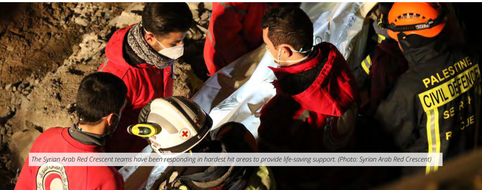
The Syrian Arab Red Crescent teams have been responding in hardest hit areas to provide life-saving support.

The Swiss Red Cross continues to address accountability and agility through provision of capacity building, focusing on finance and administration, at HQ and branch level. This effort is an essential part of the responsibilities of the finance and administrative Delegate, based in Damascus. Capacity Development needs will be provided in a participatory approach, with the respective Syrian Arab Red Crescent departments.