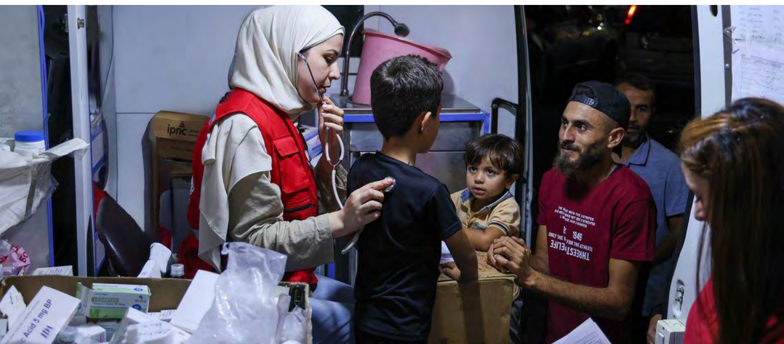
The Syrian Arab Red Crescent remains committed to standing by communities and offering relief despite its limited resources.

Regional tensions, particularly following the October 2023 Gaza conflict, have increased the risk of spillover into Syria. While spillover has been contained to limited strikes, the potential for escalation underscores the region's fragility.